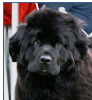
"How did I do, Mom?"